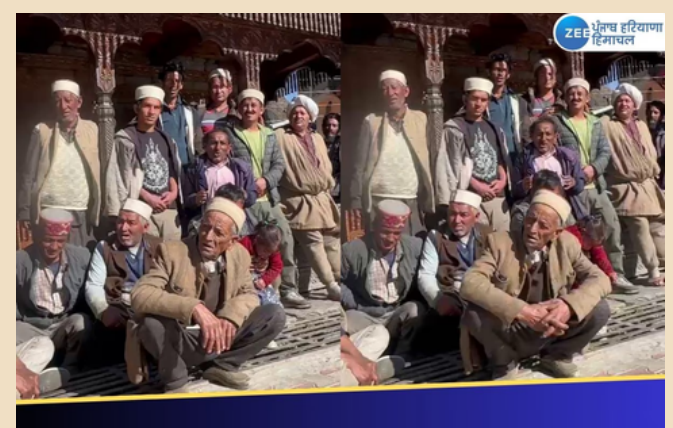
मलाणा में सड़क ही नहीं...अब राशन की भी दरकार

Link of the article: (21st November) https://zeenews.india.com/hindi/zeephh/hima chal-pradesh/malana-village-food-shortageand-road-problem-villagers-appealed-tovikramaditya-for-help/2524412