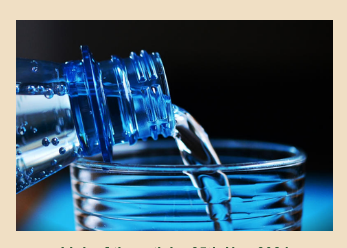
Link of the article: 25th Nov 2024 https://www.msn.com/en-in/news/India/bottledganga-water-to-be-distributed-to-devotees-atmahakumbh-2025/ar-AA1uHMlo? ocid=BingNewsSerp

The Uttar Pradesh government is set to facilitate over 25 crore devotees at the Prayagraj Mahakumbh 2025 with a unique initiative to provide sacred Triveni water at bus and railway stations. Women from self-help groups will manage the sale of Ganga water in designer moonj baskets, promoting Prayagraj's ODOP craft. Packaged in metal urns and bottles of various sizes, this service addresses the difficulty pilgrims face in collecting water amidst massive crowds. Under the National Rural Livelihood Mission, over 1,000 women will receive training, empowering them through this project. Coordination with transport officials ensures seamless implementation, enriching pilgrims' spiritual experience.