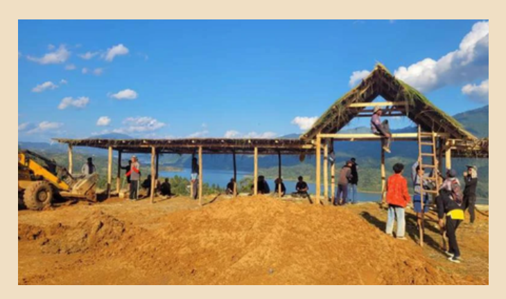
<u>Link of the article: (23rd November, 2024)</u> <a href="https://www.ifp.co.in/manipur/manipur-indigenous-communities-to-converge-at-chadong-village">https://www.ifp.co.in/manipur/manipur-indigenous-communities-to-converge-at-chadong-village</a>

The venue, Chadong Village New Site, holds historical importance, being home to displaced residents after the Mapithel Dam submerged the original village. The festival will feature cultural performances, a talent show, and exhibitions of crafts and food, offering a unique cultural experience and promoting community bonds.