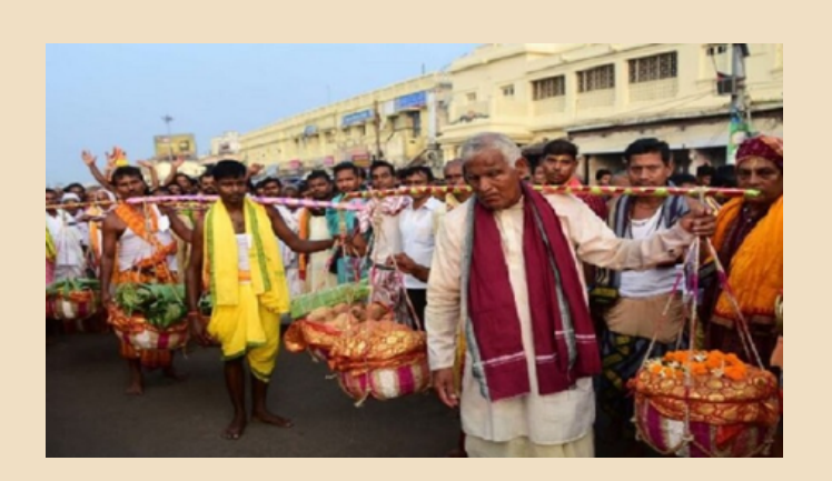
<u>Link of the article: (22nd November, 2024)</u> <a href="https://odishatv.in/news/crime/loot-in-hyderabad-company-rs-21-lakh-kept-hidden-odisha-village-recovered-248989">https://odishatv.in/news/crime/loot-in-hyderabad-company-rs-21-lakh-kept-hidden-odisha-village-recovered-248989</a>

On November 22, a grand Podhuan Bhara procession will take place from Niali Madhab Pitha to the Srimandir in Puri, marking the eve of Prathamastami, celebrated on November 23. This traditional Odia festival involves sending a bhara filled with various food items and gifts from a maternal uncle to his sister's home, honoring the eldest child. The procession will include rituals for Lord Jagannath and feature music, martial arts displays, and participation from numerous devotees. The bhara will contain items like new clothes, coconuts, jaggery, and special offerings for the deities, culminating in a presentation at Srimandir by 4 PM.