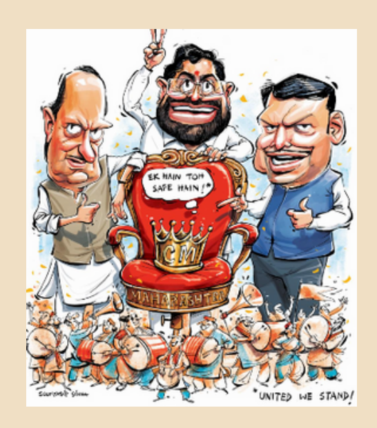
Link of the article: (24th November, 2024) https://www.thehindu.com/elections/maharashtraassembly/bjp-led-mahayuti-dominant-acrossregions-urban-rural-divides/article68902904.ece

The Mahayuti coalition's strong victory – 233 out of the 288 seats – in the Maharashtra Assembly elections was made possible due to a humongous 14-point lead in vote shares (49.3% to 35.2%) over the Maha Vikas Aghadi. 48.4% of the rural and 49.5% of the semi rural populations voted for the Mahayuti alliance. The numbers from the rural/semi-rural agrarian hubs of Maharashtra suggest that the Mahayuti was able to overcome the farmer anger that was visible in the Lok Sabha election. The coalition did the best in semi-urban constituencies (51.9% vs 32.4% for the MVA) while the MVA's significant drop in support in urban seats (by 11.1 points) was helpful for the Mahayuti's rich harvest of 32 seats.